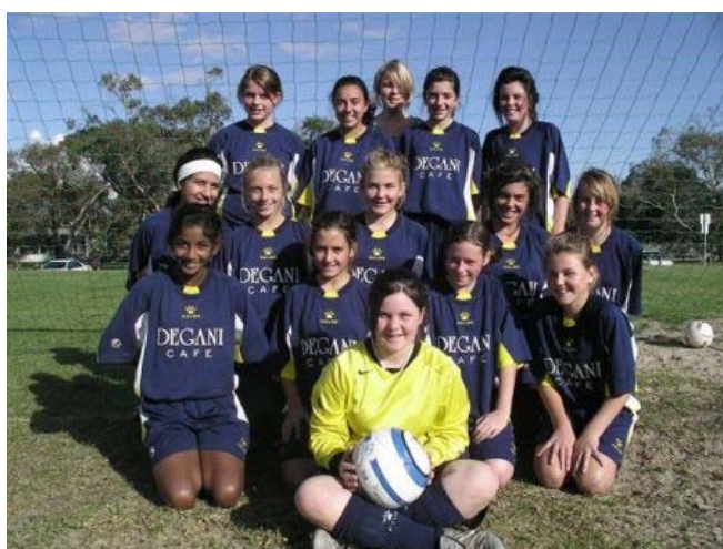
In the new outfit with Degani Cafe's sponsorship logo